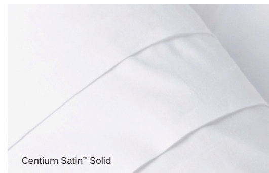
Centium Satin™ Solid